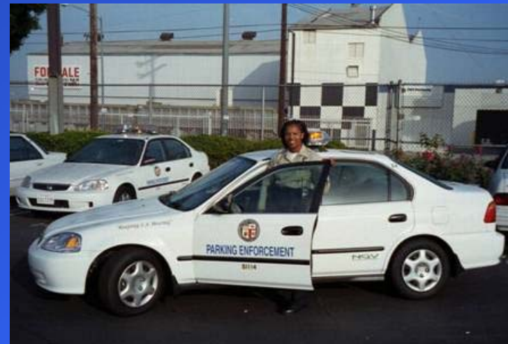
Los Angeles Parking Enforcement