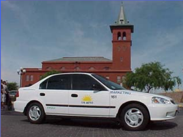
El Paso's Sun Metro Transit