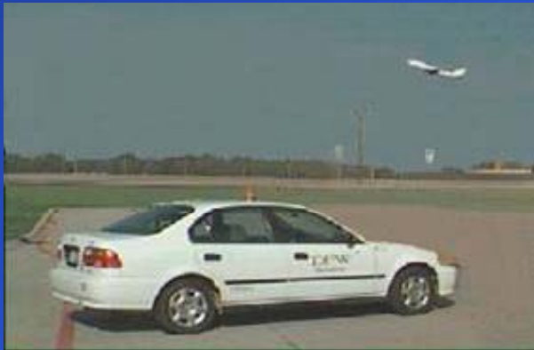
Dallas/Fort Worth Airport