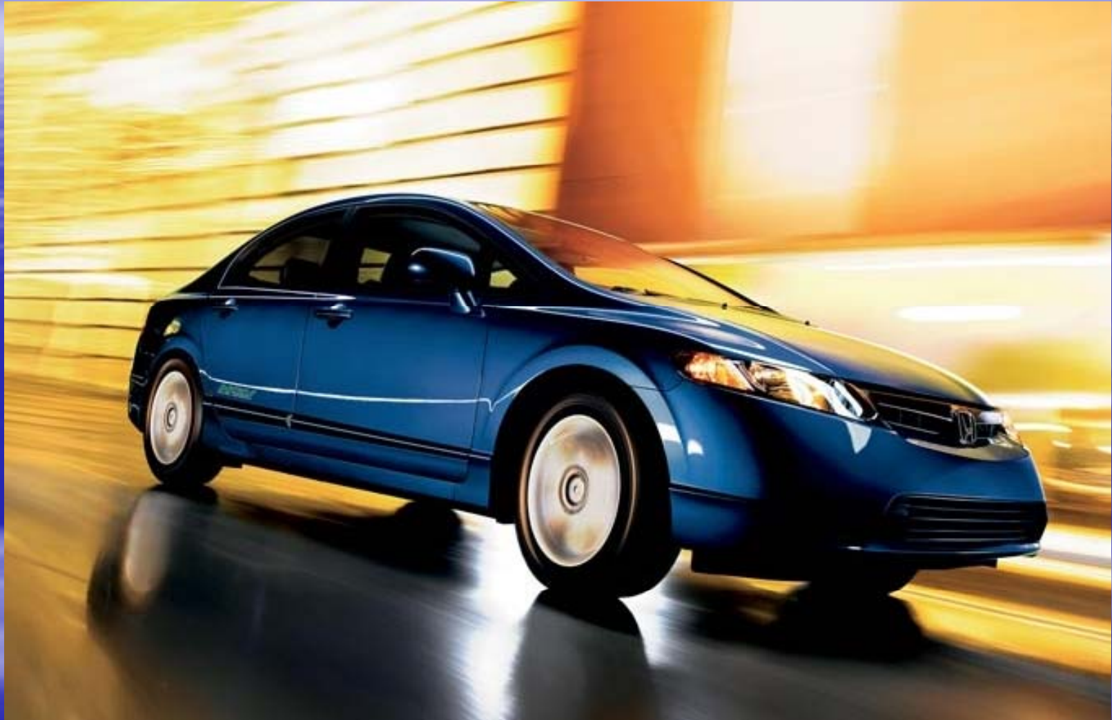
Natural Gas Civic GX